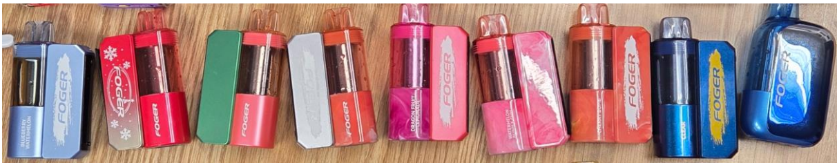
Source: Products collected from a California high school, 2025–2026 school year

While 'the survey data doesn't specify which Fogger product was used, we suspect the Switch Pro is the dominant product for a few reasons. First, a participant in the Young Adult Cohort commented, "Fogger vape[s] are becoming a lot more common, and I think a lot of people are transitioning to rechargeable vapes because of their longevity." Second, the Nielsen data documents only the Switch product. Lastly, this is supported by data from our youth tobacco products monitoring project, a volunteer survey of school professionals who upload images of tobacco and nicotine products being confiscated from U.S. middle and high school students. As of March 2026, we have received over 1,700 images from 27 U.S. states of more than 10,600 tobacco and nicotine products. We have received images of Fogger products from seven states: California, Colorado, Florida, Hawaii, North Carolina, Ohio, and Wisconsin. We first identified Fogger during the 2024–2025 school year, with a notable increase during the 2025–2026 school year; among 69 pod devices submitted during the 2025–2026 school year, 27 (39.1%) were Fogger. We identified both the Switch Pro pod device and the Bit 35k disposable Fogger brands in this sample, but as shown in the image, the Switch Pro is the most common. We identified 24 distinct flavors, including nine fruit flavors, five candy/dessert flavors, four with "ice" in the name, three mint flavors, two drink flavors, and "clear."